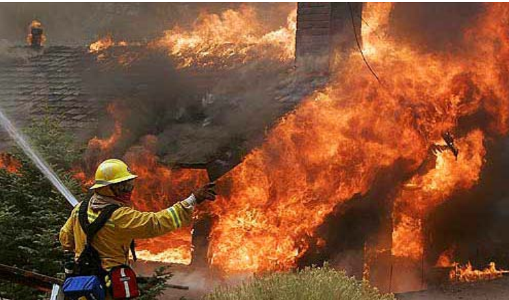
CA Wildfires 2007