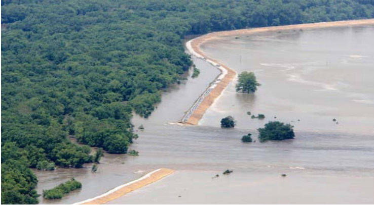
Midwest Flooding 2008